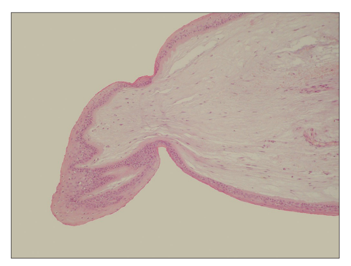
Figure 2. Histology of the Vocal Cord Nodule. Overview of the vocal fold nodule histology stained with hematoxylin and eosin (HE 20x). Presence of hyperplastic epithelium, basement membrane thickening and few changes in the lamina propria.

Phonotrauma is largely responsible for the formation of the benign laryngeal lesions more frequently seen in