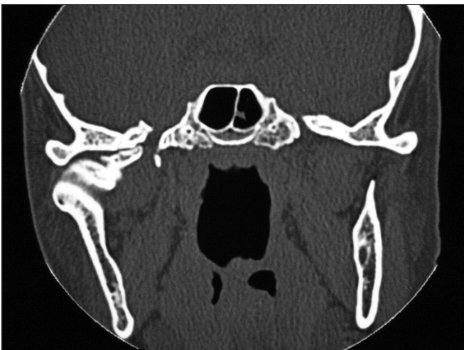
Figure 5. Coronal CT scan: peripheral osteoma in the right-side mandible condyle.

are large enough to cause facial asymmetry or some functional deficit.