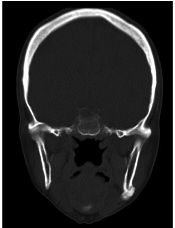
Figure 3. 2-year postoperative: Coronal view showing a recurrence in the left mandible angle.

The three cases located in the condyle caused facial asymmetry, dental malocclusion and consequent functional deficit (Figures 4 and 5).