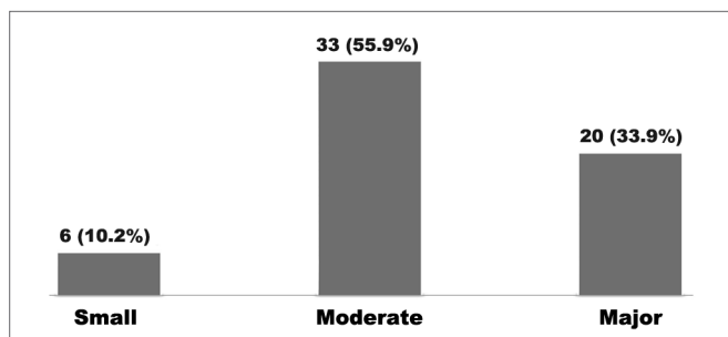
Graph 1. Impact on the quality of life in children seen between August of 2008 and March of 2009; n (%).

suffering" ( 17.3 \pm 5.0 ), "emotional suffering" ( 11.8 \pm 4.52 ), and "diurnal problems" ( 8.0 \pm 4.0 ). The mean global score for quality of life was 5.35 \pm 1.45 .