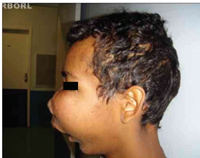
Figure 1. Recurrence of maxilla ameloblastoma.

The mandible was the most affected site. Nineteen (47.5%) patients had tumors restricted to the mandible body. Of these, five (12.5%) went beyond the mid-line. Eight (20%) had involvement of the mandible body and angle or angle and ramus; in 10 (25%) cases the lesion advanced to the body, angle, ramus and condyle; and three cases (7.5%) involved the maxilla - a less frequent location (Figure 1).