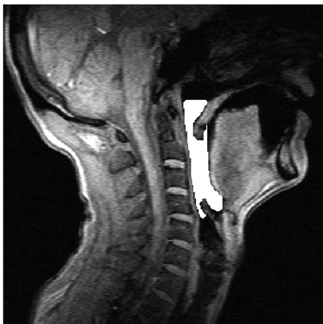
Figure 1. Image showing the PMP area defined superiorly by a line passing along the hard palate to the posterior pharyngeal wall, inferiorly by the back of the vallecula, posteriorly as the posterior pharyngeal wall, and anteriorly as the base of tongue and the soft palate.

The area that was assessed was only the air space; hard or soft tissues were not included. This area was defined on the sagittal plane of the pharyngeal midplane, superiorly by a line passing along the hard palate to the posterior pharyngeal wall, inferiorly by the back of the vallecula, posteriorly as the posterior pharyngeal wall, and anteriorly as the base of tongue and the soft palate (Figure 1). This region was named the pharyngeal midplane (PMP) area. The PMP area was measured pixel by pixel in sagittal images using the abovementioned software, which yields simultaneous views of three orthogonal planes and makes it possible to accurately define the anatomy. It generates a binary file from which the area may be calculated.