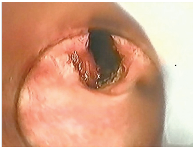
Figure 2. Unilateral microtrapdoor flap: posterior glottic stenosis grade III.

posterior glottic stenosis involving one of the cricothyroid joints, as described by Remacle. 9