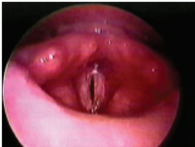
Figure 1. Posterior glottic stenosis grade III.

The microtrapdoor flap technique first described by Dedo & Sooy 10 was used initially in eight patients (47%) (Figure 2) with posterior glottic stenosis. In this technique, an incision is made on the superior surface of the stenosis, the submucosa is dissected with CO 2 laser to create a bipediculated lateral mucous flap, and the underlying scar tissue is removed. A variant of the microtrapdoor flap was used in eight patients (47%); in these cases, a vertical incision was made on the vocal process on one side and extended through a horizontal incision on the posterior interarytenoid surface to the other side, thereby creating a crescent moon-shaped unilaterally based mucous flap.