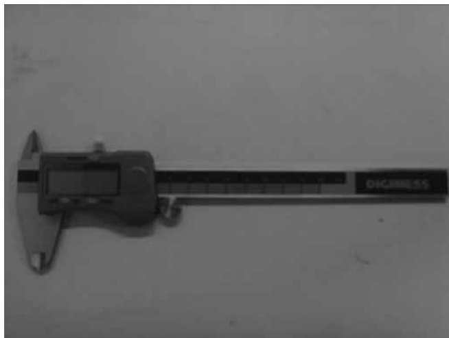
Figure 1. Digimes Pró-Fono Digital Caliper

The present study used the following materials: Sliding-type Pro-Fono Digimes Digital Caliper (Fig. 1), disposable surgical gloves, cotton balls, hydrated ethylic alcohol, Facial Paralysis Clinical Assessment Protocol 27 , Complementary Protocol of mandibular range of motion values.