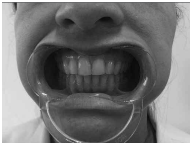
Figure 2. Midline.

For each value we did a total of six measurements (three measurements from each speech and hearing therapist). The individuals were positioned in the following way: seating with their feet on the floor, head in the standard position, placed according with the Frankfurt horizontal plane. The examiner was placed in front of the individual in order to take the measure. Should a difference of more than 25% be seen in the results, the value was measured again.