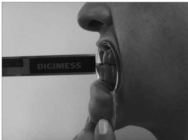
Figure 6. Mandibular protrusion.

For the statistical analysis of the data we used the ANOVA, confidence interval for the mean and p -value tests, with 0.05 significance level (5%).