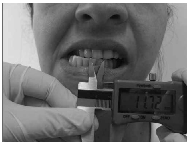
Figure 4. Mandible lateralization to the right.