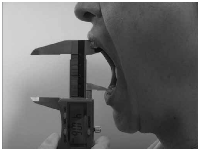
Figure 3. Maximum mouth opening.

For each value we did a total of six measurements (three measurements from each speech and hearing therapist). The individuals were positioned in the following way: seating with their feet on the floor, head in the standard position, placed according with the Frankfurt horizontal plane. The examiner was placed in front of the individual in order to take the measure. Should a difference of more than 25% be seen in the results, the value was measured again.