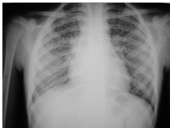
Figure 3. Case 3. Disseminated pulmonary reticulonodular infiltration.

The patient was treated with a triple regimen (isoniazid, rifampicin and pyrazinamide). Improvement of the clinical picture allowed the patient to be discharged seven days later; only the external auditory canal was stenotic. At this point audiometry showed moderate conductive hearing loss in the left ear.