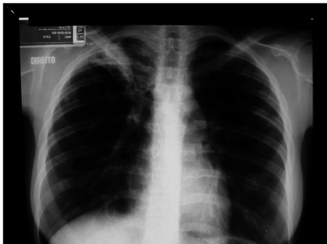
Figure 2. Case 2. Asymptomatic pulmonary involvement in the right apex and the left base of the lung.

Tympanoplasty was done four years later; this procedure showed that the hammer was partially eroded and that the anvil was fixed. The anvil was removed, the head of the hammer was sectioned and the anvil was interposed between the rest of the hammer and the head of the stirrup. The tympanic membrane was repaired with a perichondral graft from the tragus. Six weeks later the perforation recurred close to the canal, and increased further by ten weeks. The myringoplasty was reviewed one year after the first procedure; the graft had a small perforation. The ear, however, was always dry, here was no vertigo or hearing loss.