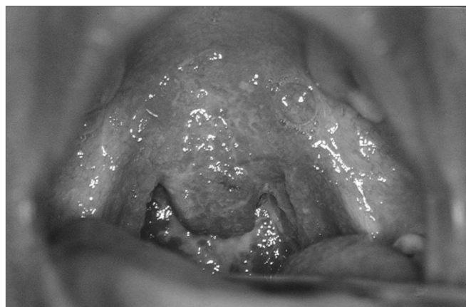
Figure 1. Granulomatous infiltrate in the oropharynx.

Physical exam: 16-week pregnant patient had soft palpable and painless nodes in her left sternocleidomastoid region, without signs of infection or fistula. In the oropharyngoscopy we noticed a granulomatous, hyperemic, friable lesion, involving the soft palate, uvula, tonsils and the posterior pharyngeal wall, especially on the right side, without secretions or ulcerations (Figure 1). The rest of her oral cavity did not show alterations.