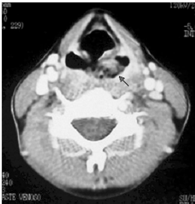
Figure 2. Neck CT scan, axial view: tumor mass in the left piriform cavity.

the prescription of many antibiotic agents in association (ceftazidime, amikacin, imipenem, vancomycin, amphotericin B e fluconazole).