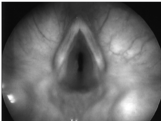
Figure 1. Subglottic edema.