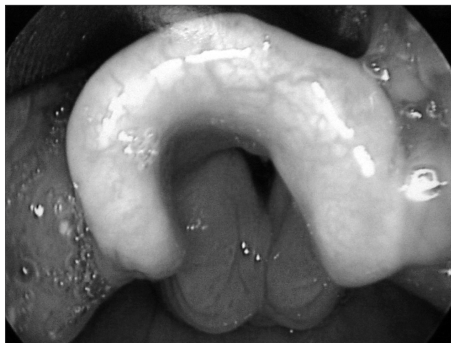
Figure 2. Edema in the interarytenoid region.