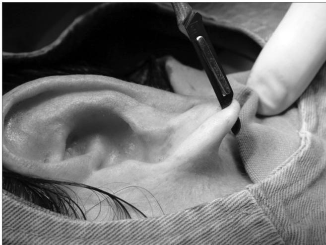
Figure 1. Photograph showing a longitudinal incision completing the earlobe cleft towards the lower border, splitting the lobe in 2 halves.