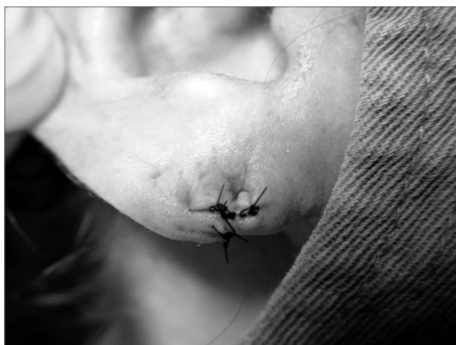
Figure 10. Photograph showing the final surgery outcome. We see the orifice for earring placement, totally epithelialized.

the surgeon noticed and 2 had cosmetic deficits noticed by both the surgeon and the patients, requiring a “second look” procedure (Chart 1).