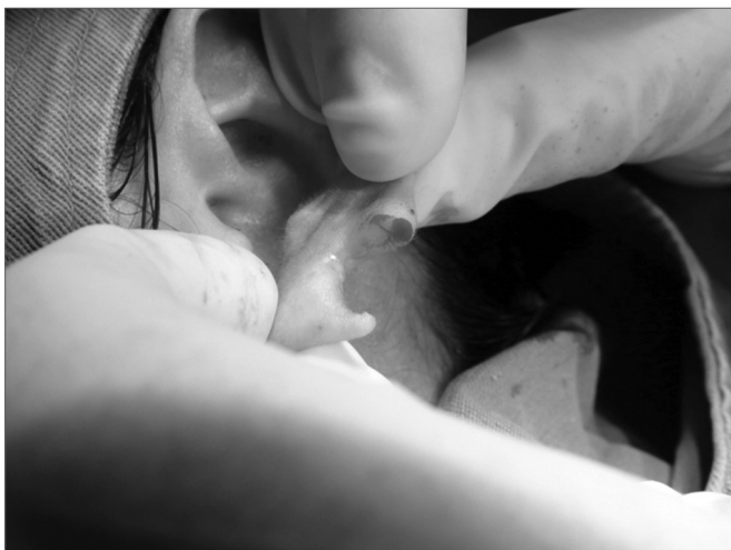
Figure 2. Photograph showing the earlobe split in two flaps.