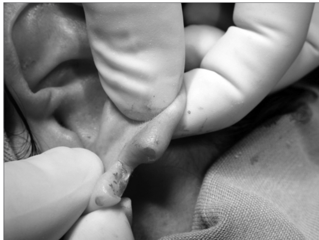
Figure 4. Photograph showing anterior lobe flap with an open wound in the posterior face.