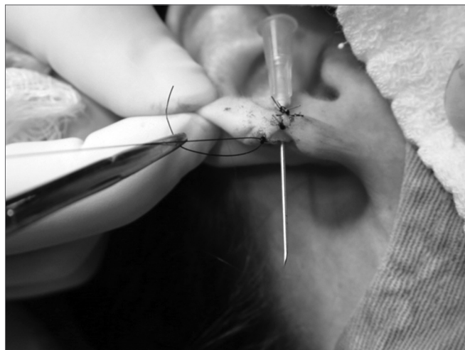
Figure 9. Photograph showing lobe flap suturing with 5-0 nylon and the needle in the final orifice for an earring placement.