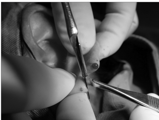
Figure 3. Photograph showing scraping on the anterior lobe flap.