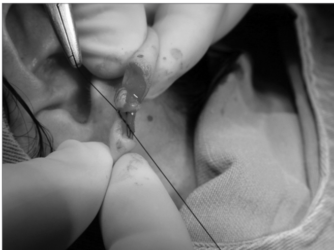
Figure 7. Photograph showing a central flap rotation in such a way as that the epithelialized borders make the lobe orifice and mononylon 5-0 suturing.