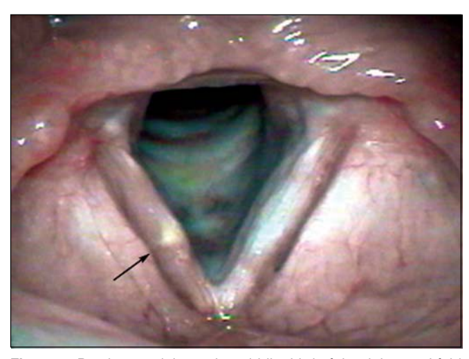
Figure 3. Bamboo nodule on the middle third of the right vocal fold (Arrow).