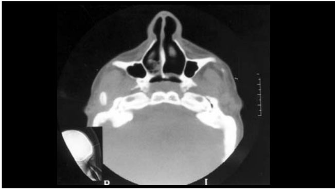
Figure 4. CT scan showing choanal atresia (predominance of bone tissue on the left lamina) – axial section.