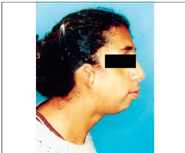
Figure 2. Clinical signs of Treacher Collins' syndrome (profile).