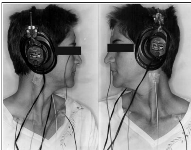
Figure 1. Position of the patient in lateral rotation and position of reference and ground surface electrodes

We assessed mean value of amplitude P1-N2, wave P1 and N2 in subjects with presence of symptoms and compared the group of patients with absence of symptoms.